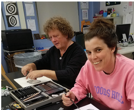
Students sharpening their drawing techniques in Beginning Drawing I class.