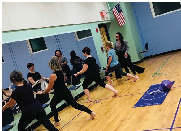
Students in Raqisa class doing exercises that involve a subtle blend of mindful belly dance inspired movements.

RAQISA®, The Belly Barre Workout is the only accredited barre for belly dance format. The program is designed to tone, sculpt, and chisel your entire body, while you learn easy to follow core strengthening and lengthening belly dance movements. Revitalize your health and fitness level with strength and grace, and improve your quality of living as you enhance your posture and stamina. Bring a mat, water, and wear comfortable fitness attire; a toning ball and resistance bands will be provided to add intensity. Specialized mats and other supplies will be available for purchase in class, but not required to enjoy the class. The instructor has drawn on her years as a fitness instructor and her award winning belly dance style to create this exciting new format – join us to discover how much fun you will have getting fit! Limited to 18.