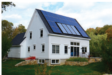
A visit to this zero net energy home in Westwood is included in the Zero Energy Home course.